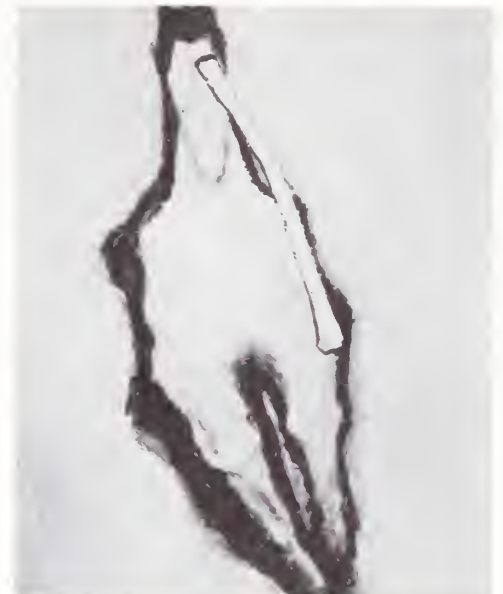
Susan Rothenberg, For the Light , 1978-79

Along with greater emotion and content in non-objective art, another aftermath of Minimalism was a return to representation, figuration, and decoration. As seen in the work of Robert Kushner, pattern and decoration painting, with its serial repetitions and elaborations on the grid structure, was a florid outgrowth of Minimalism and, in many cases, sublimated meaning to pure visual effervescence. (Photo Realism, one of the first manifestations of this return to representation, is not included here, since its chaste, deadpan representation of facts downplays emotion and individualism.) It was with iconic treatments and ironic narrative, more than with realism, that those who have come to be called New Image painters—Jennifer Bartlett, Neil Jenney, Lois Lane, Robert Moskowitz, Susan Rothenberg, and Joe Zucker—reacted to Minimalism. As